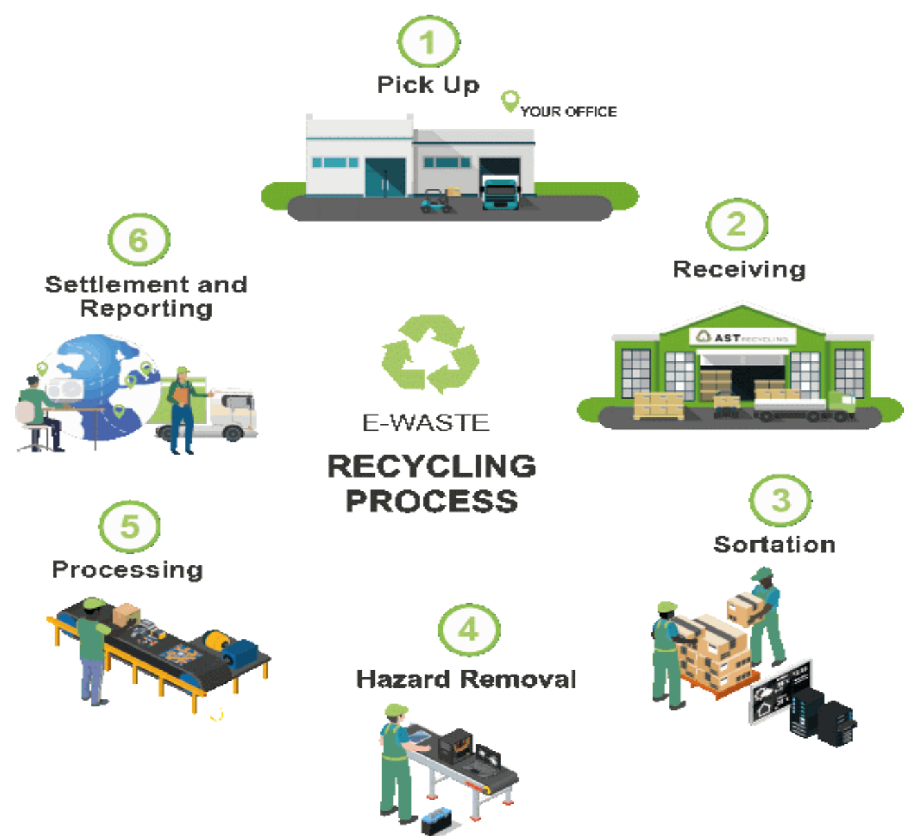
Figure 3. E-Waste recycling: Out with the Old and in with the New

Dust is the main source of e-waste pollutants that are emitted into the atmosphere. Humans are exposed to this in considerable amounts through eating, breathing, and skin absorption (Mielke & Reagan, 1998). Between 50 and 80 percent of the US's collected e-waste for recycling is transported to less developed countries, according to the 2007 report "Exporting Harm: Trashing of Asia" by the Basel Action Network and Silicon Valley Toxics Coalition. Human exposure to dioxins is 15–56 times higher than the WHO recommends due to air pollution (Chatterjee, 2007). E-waste differs from other types of domestic or industrial waste in terms of both chemical and physical structure. It contains both useful and dangerous ingredients that require careful handling and recycling