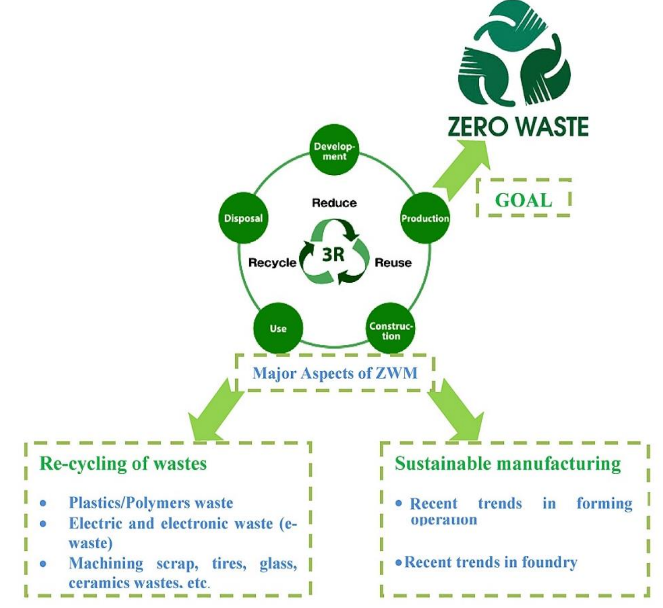
Figure 1. Illustration of zero waste and its process.

disposal in landfills. Due to community involvement, the groundbreaking idea was first presented in Canberra, Australia. Canberra, Australia, became the first city in the world to formally adopt a zero-waste objective when municipalities there submitted the first "no waste" legislation, No Waste by 2010, in 1995 (Zaman & Connett, 2013).