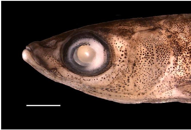
Figure 3. Pectenocypris nigra , holotype, head, lateral view. MZB 22149. Scale bar = 0.5 mm. Note whitish symphyseal knob on lower jaw and extension of mid-lateral stripe on opercle (large roundish melanophores in upper half of opercle).

depth at dorsal fin origin 18.4-20.2 (19.3) [18.8], caudal peduncle depth 10.1-11 (10.6) [11], caudal peduncle length 17.7-18.6 (17.8) [18.2], snout length 7.2-8.1 (7.5) [7.7], eye diameter 7.7-8.9 (8.4) [8.4], postorbital length 10.9-11.8 (11.4) [11.6], interorbital width 9.6-10.6 (10.0) [10.0], dorso-hypural distance 49.2-50.6 (49.7) [49.5]. As percentage of head length: snout length 27.3-28.6 (27.8) [27.4], eye diameter 29.1-31.8 (31.0) [29.6], interorbital width 34.4-38.1 (36.0) [35.6], postorbital length 41.2-42.8 (41.3) [42.5]. As percentage of eye diameter: interorbital width 114.0-118.9 (116.7) [118.9]. As percentage of caudal peduncle length: caudal peduncle depth 58.2-61.7 (59.6) [58.6].