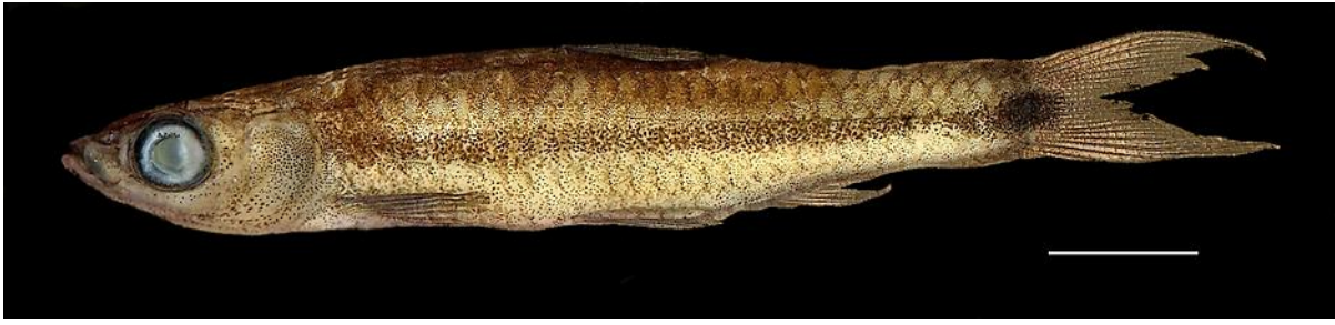
Figure 2. Pectenocypris nigra , holotype, 33.1 mm SL, lateral view. MZB 22149. Scale bar = 5 mm. (right side, reversed). Mid-lateral stripe does not extend on opercle (opercle covered by many similar sized small melanophores).