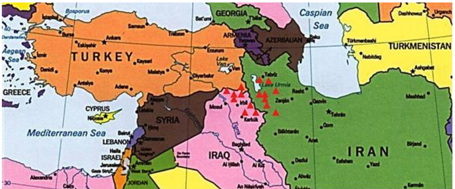
Figure 1. Distribution map of Gundelia rosea (▲) in Turkey, Iraqi Kurdistan (northern Iraq) and Iran.

Description: Perennial herb with branched stem up to 30-90 (-100) cm. Leaves coriaceous, prostrate, alternate, pinnatilobate or pinnatisect, spiny. Both side short or arachnoid hairs, especially on or besides the veins. Synflorescences normally 8-50, globose or ovoid, 40-60 mm long and 30-50 mm in diameter (excluding bracts), consisting of 50-70 cephaloids. Synflorescence densely covered with arachnoid hairs when young. Bracts spiny, more or less exceeding cephaloids, with a strong terminal spine and 2-4 lateral spines, with additional smaller spines in between, in aberrant forms bracts up to 50 mm long, and to 10 mm broad. Bracts densely covered by tomentose and arachnoid hairs and are normally tinged with purple. Cephaloid (in the middle of the synflorescence) compound of (6-) 7-8 flowers. Flowers campanulate to widely spreading, corolla externally purplish to dark red, internally pinkish, 14-18 mm long (usually central longer than lateral), tube very narrowly. Synflorescence glabrous. Fruit complex (disseminule) normally conical to obovoid, greyish to light brown, 13-20 mm long (without spines), in upper part 8-14 mm in diameter (when ripe), central and lateral flowers surrounded by spines originated from the involucels, spines of the central flowers 2-7 mm, of the lateral flowers 1.5-6 mm.