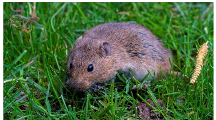
Fig. 2. Microtus hartingi.