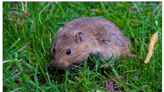
Fig. 2. Microtus hartingi.