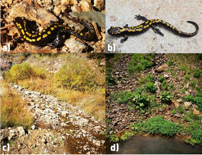
Figure 3. The general view of adult male (a) and female (b) of Mertensiella caucasica from Gümüşhane province with its biotope from Kocadal stream (c) and Kalis stream (d).

distribution. All known and new localities were showed in the Fig. 4.