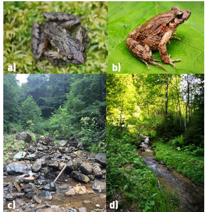
Figure 1. The general view of adult male (a) and female (b) of Pelodytes caucasicus from Giresun province with its biotope from Gelevera stream (c) and Cimbirtlık, Dereli (d).

During our fieldworks, tadpoles and adults of P. caucasicus were found in the vicinity of Gelevera River, Giresun province. Also, adult specimens were photographed in the Cimbirtlık Forests between Dereli and Kümbet, Giresun province (Fig. 1). With these new localities, the distribution of P. caucasicus was extended 90 km air distance to the west, from the western known locality (Hıdırnebi, Trabzon) (İğci, et al., 2013). Also, the authors stated that Prof. Dr. David Tarkhnishvili had photographed a juvenile individual from Turnalık, (Ordu province) (İğci et al., 2013). Thus, our records filled the gaps its distribution and strengthened presence possibility in the Ordu province. We prepared a detailed distribution map for Caucasian Parsley Frog, with both old and new records, to provide a basis for future conservation and management studies (Fig. 2).