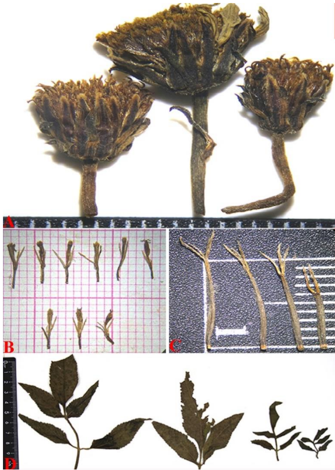
Figure 3. Morphological characteristic of Bidens pilosa : A-Capitula; B-Leaves; C- Fruits; D-Leaves.

Distribution of Bidens pilosa in Turkey: Osmaniye: Kırmıtlı ile Yeniköy arası, Kırmıtlı içmesuyu sondaj alanı yanı, taşkın seddesi kenarı, sulama arkı çevresi, tarlalar arası, yol kenarı, sulama arkı boyunca, 37° 9'41.31"K, 36° 8'42.46"D21.08.2018, H. Yıldırım 7694 (EGE!) (Fig. 4).