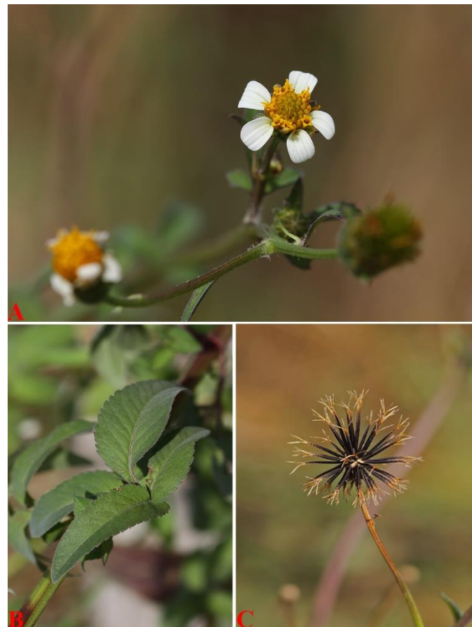
Figure 2. Bidens pilosa from its natural habitats in Osmaniye, A-Capitula; B-Leaves; C- Fruits.

Suggested Turkish name: The Turkish name of this species is given as “Tarlasuketeni”, according to the guidelines of Menemen et al. (2013).