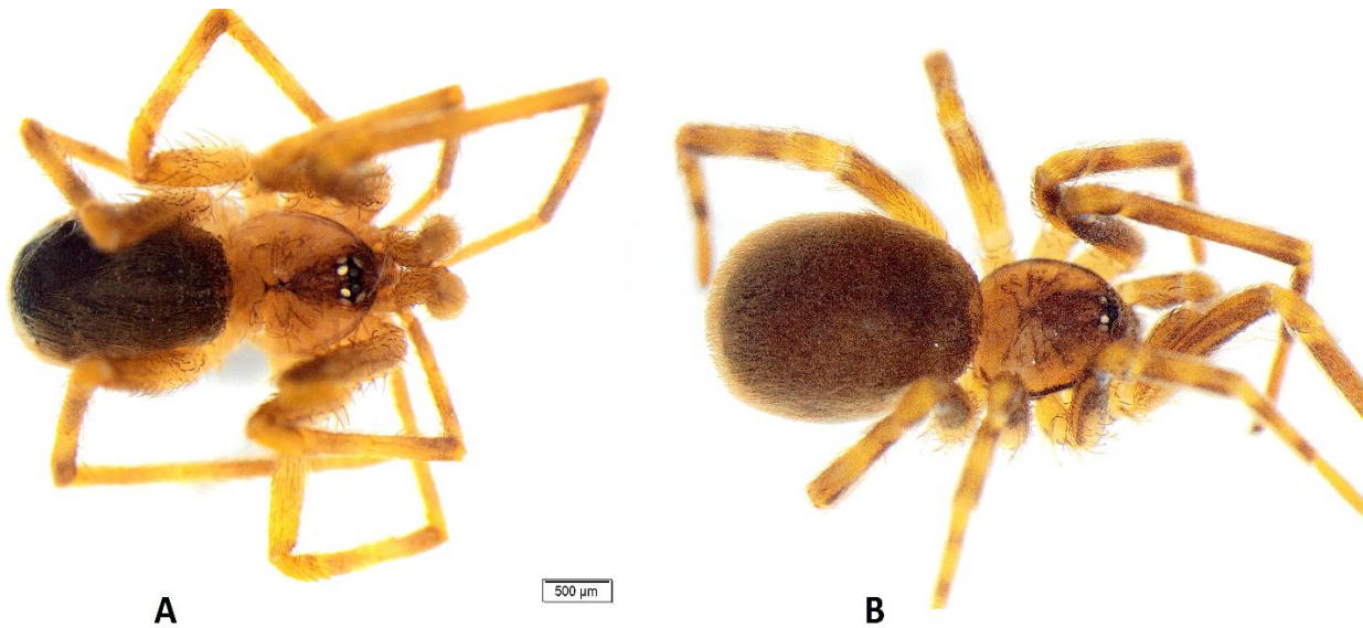
Figure 2. General habitus of Zaitunia annulipes (Kulczyński, 1908): A- male, B- female.