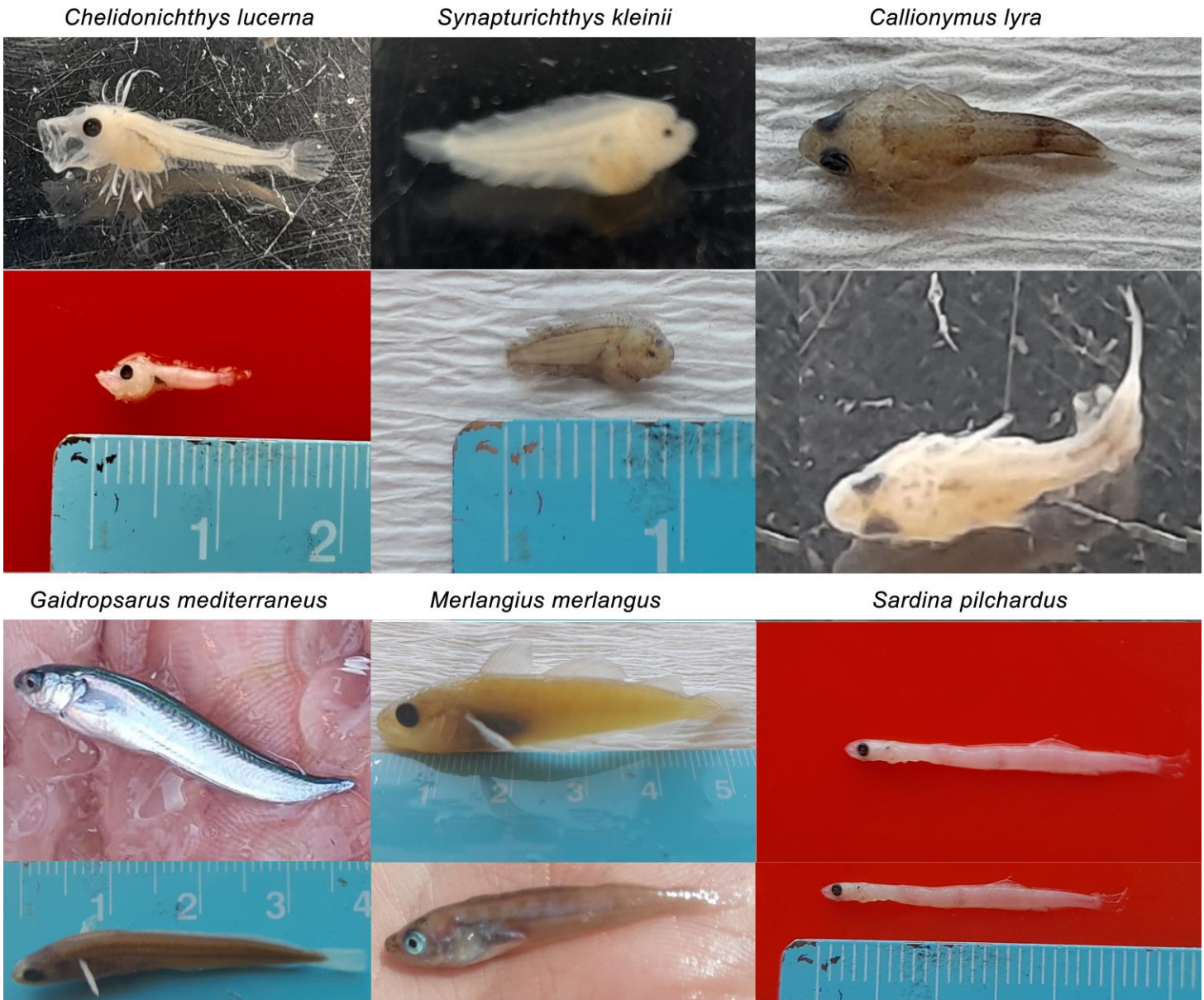
Figure 3. Early life stages of fish caught with frame net sampling in the Marmara Sea pelagic environment