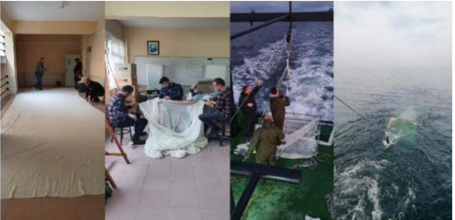
Figure 2. Frame net design and sampling

where D is the mean biomass ( n/1000 \text{ m}^3 ) of pelagic juveniles, N is the number of pelagic juveniles per haul, and V is the filtrated volume by flow meter. Using the mean biomass ( D ) of each location, temporal and spatial variations of biomass were calculated.