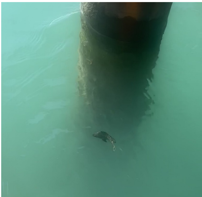
Figure 3. The same individual displaying active swimming behavior following initial disturbance