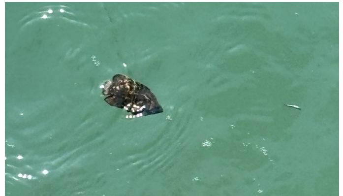
Figure 2. Juvenile Lobotes surinamensis exhibiting characteristic leaf-like posture near the surface in Antalya Bay, Turkey (26 August 2025), observed alongside unidentified juvenile fish.

first documentation from Antalya Bay (Bilge et al., 2017; Ergüden et al., 2018, 2020).